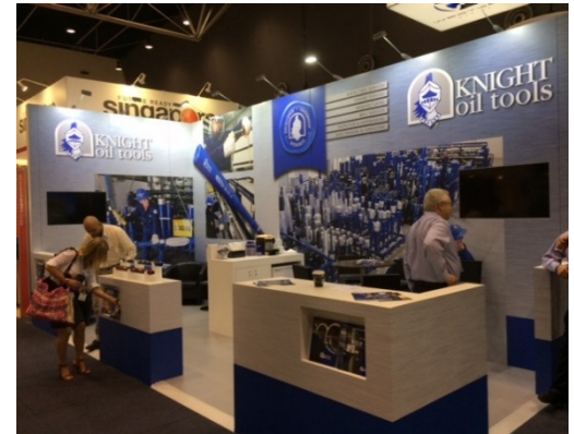
Knight Oil Tools International recently exhibited at the 2015 Australasian Oil & Gas Exhibition & Conference held March 11-13 in Perth, Australia.